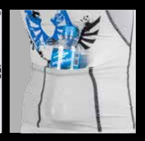
2 dorsal pockets.