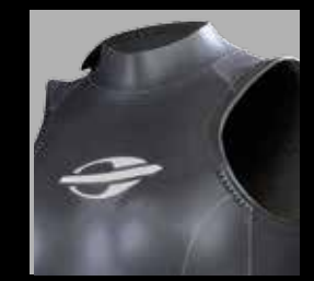
New neck with SCS both Longer Zipper for faster side and lower collar. Reduction of water flow through the neck, more comfortable, less friction.