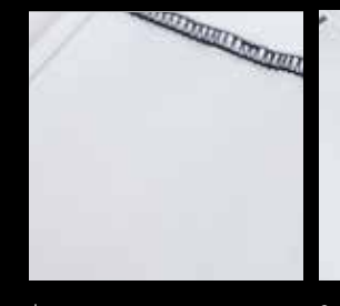
Sport Lycra Pro Compression fabric - help slider and puller. to muscle recovery and thermal comfort.