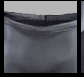
Made with SCS outside and nylon inside.

S503THT S503THTB - Blindstitch lmm Colors