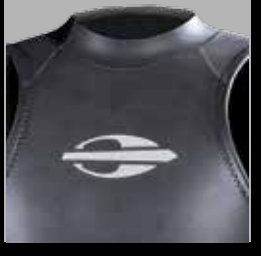
New neck with SCS both Longer Zipper for faster side and lower collar. Reduction of water flow through the neck, more comfortable, less friction.