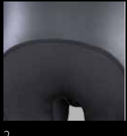
Neoprene super stretch between legs - Greater comfort and freedom on movements.