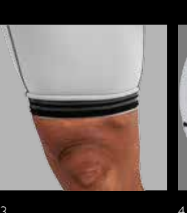
Elastic silicone on the leg Side pocket. edge to better grip.