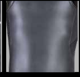
The suits parts are more entire in order to contribute for low surface friction coefficient.